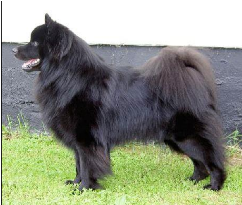
Male of excellent type