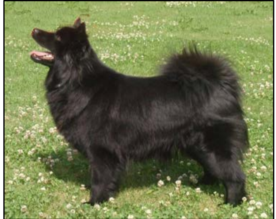
Female of excellent type