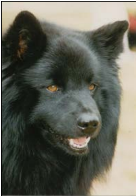
The eyes slightly small, a bit light and could be rounder.

Two excellent shaped male heads. Both very masculine, strong muzzles, very well marked stops and rounded foreheads.