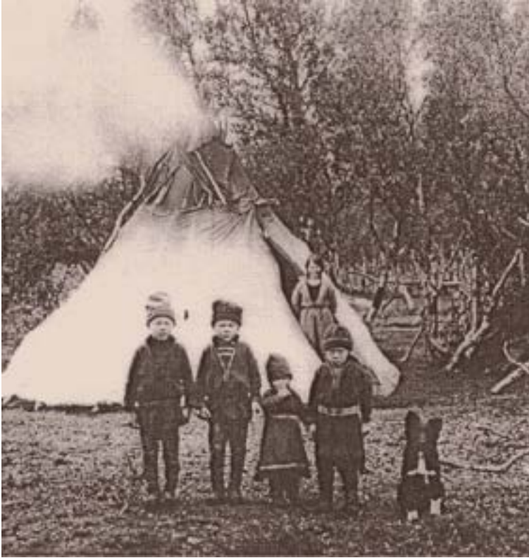
Sami children photographed with their Lapphund