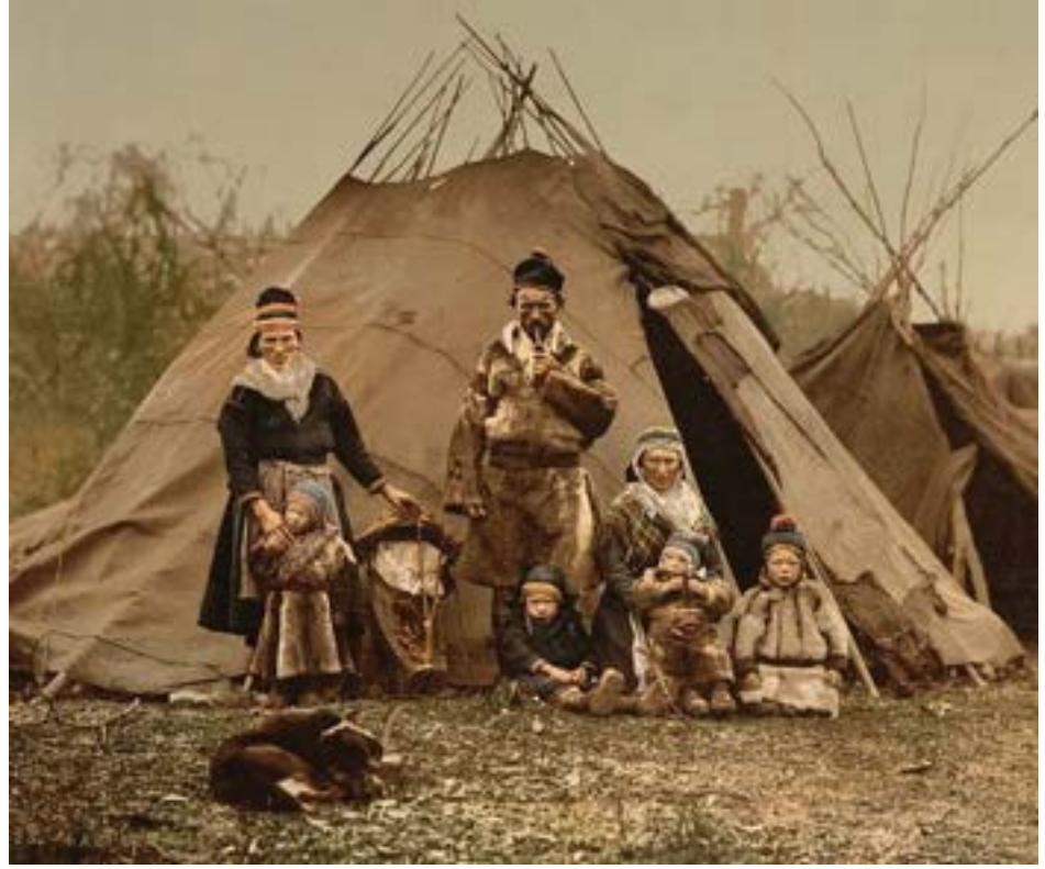
A Sami family around 1900, note the Lapphund lying in front