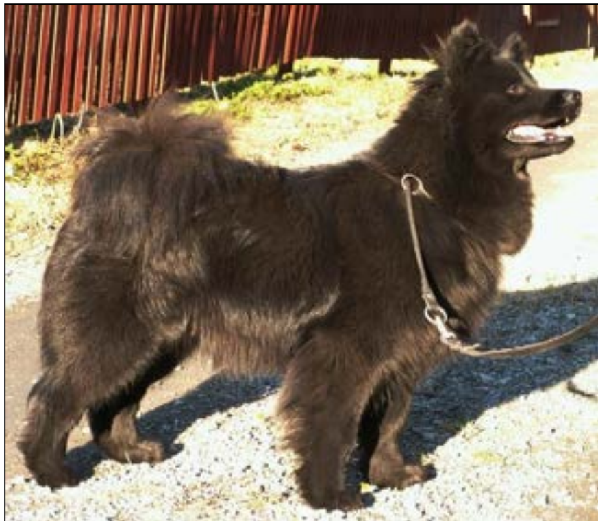
"Bear brown" female.